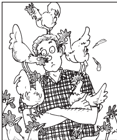
THINGS HAD EXPANDED SOMEWHAT SINCE THE ARRIVAL OF CLUCKY AND CLARA

Even a sole trader turning over £80,000 a year needs to have some simple systems and procedures in place. You may not employ anyone to raise your invoices and pay the bills, but you could probably do with some help with your VAT return, accounts or even your payroll as well as your end of year tax computations and tax return. We're here to help.